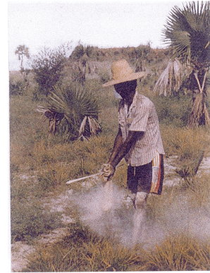
Application of insecticides for locust control in Madagascar

Conclusions: Without intensive measures (trained personnel, adequate infrastructure equipment and financial resources, strong pesticide legislation, etc. ), chemical control of locusts does affect human health, although it depends on the nature of the active ingredient. Because of poor safety in the use of pesticides in Madagascar and similar countries, not only can handlers be affected but also a significant part of the neighboring population.